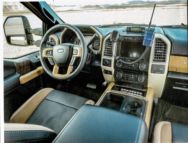
The interior of the Operator is a really nice place to spend some time.

Few vehicles demanded as much attention at the SEMA Show as the Operator, and while the custom digi-camo paint turned some heads it was the impressive custom cab-over UTV bed mount that really drew the crowds, especially with a ‘17 Textron Wildcat X UTV mounted. The mount is a first-of-its-kind unit from Sherptek, called the Dragon Back Dek. It is frame mounted, utilizing the factory